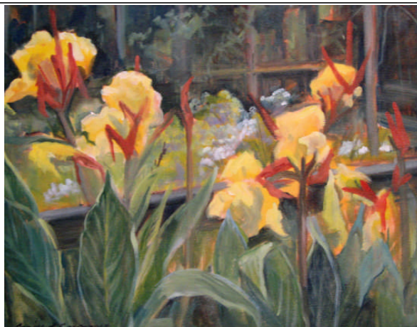
Summer's End by Janice Crummer