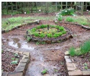
Herb Garden Bog

The area below the pond decided it was a watershed, and the roses planted there were not thrilled with that idea. Amy and I spent a cold morning in the rain, digging a ditch to channel the water around the bed.