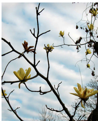
More yellow magnolias

Detailed schedules of demonstration times will be available on the website soon. (See the link below.)