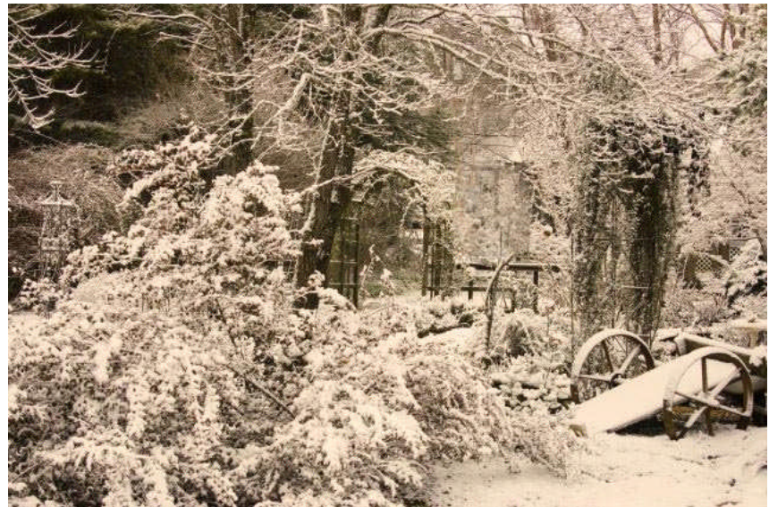
White Wagon Farm on March 4, 2008

I am pretty sure that the Romantic poet, Shelley, must have had weather like ours in mind when he wrote: